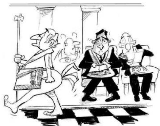
When visiting other Lodges it's interesting to see slight variations of the ritual.