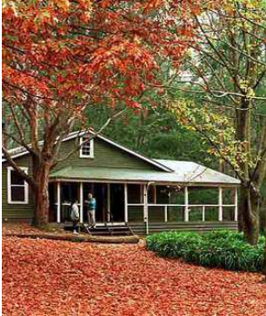
Part of OUR heritage