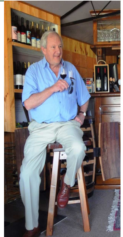
... For he's a jolly good fellow ...