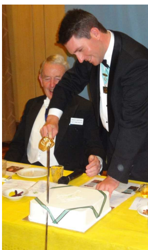
The Cake under attack ... enjoyed by all.