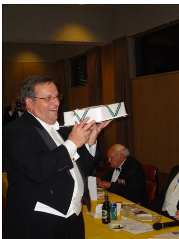
The Grand Cake Bearer