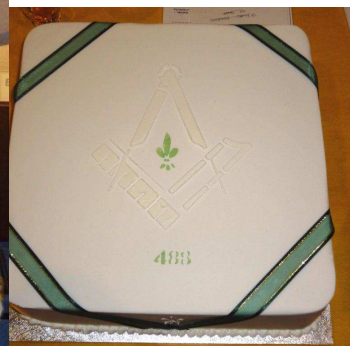
A beautiful Installation Cake ... before desecration... by sword.